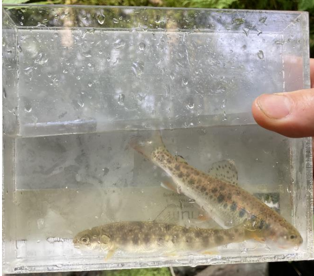
Top Right: Two cutthroat captured in trap #10, Top Left: Two coho and one sculpin captured in trap #7, Bottom Right: One cutthroat and one Dolly Varden captured in trap #9.

Notes: A culvert was removed from Mink Creek to improve fish passage on 8/7/2020. Trapping was conducted to monitor efficacy of this restoration project. Traps #1-3 were set downstream of the old culvert site on 7/25/2023. Trap #4 was set under the foot bridge where the culvert used to be, and traps #5-7 were set upstream. Traps #8-10 were set well upstream where the technicians own private property. Coho were captured as far upstream as trap #7 and cutthroat and Dolly Varden were captured in the uppermost trap. A culvert with a 0.5' outfall height at medium streamflow passes under Mud Bay road, downstream of where traps #8, 9, and 10 were set. While this red rated culvert is likely inadequate for fish passage, it is not a full barrier to Dolly Varden and cutthroat trout.